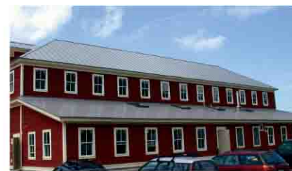
Thayer Hall after