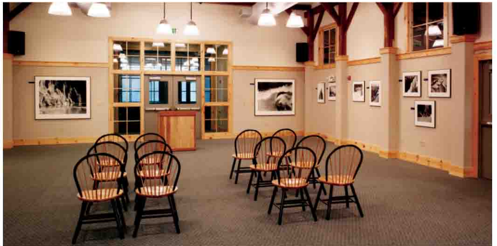
Thayer Hall features the Brad Washburn Conference Center, as well as offices, meeting rooms, and dorm rooms within the timber-frame grid of a barn.

braced steel frame, it required an uninterrupted insulating wrap outside of the frame and metal stud infill. The construction team integrated 6 1/2 inches (165 mm) of expanded polystyrene insulation panels in Highland Lodge's walls; 8 1/2 inches (216 mm) of insulation panels were installed in its roof. The insulation type was chosen because its manufacturer recycles scrap insulation during