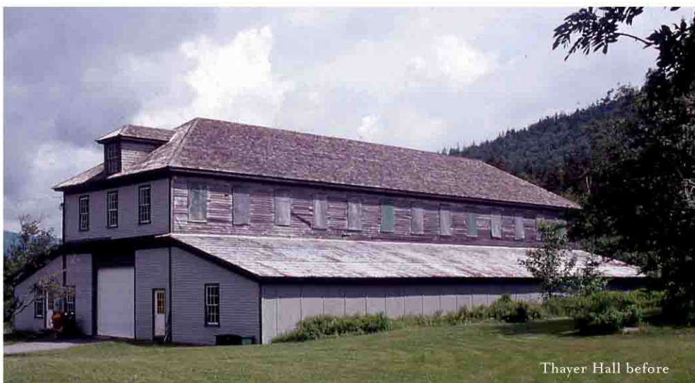
Thayer Hall before

For example, all buildings are situated east to west to maximize daylighting, summer breezes, and views of the area, as well as minimize noise from nearby Route 302 and