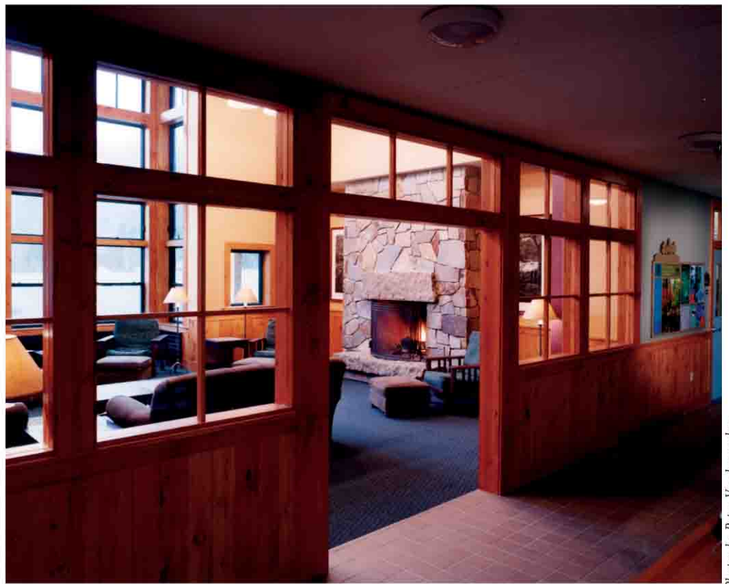
The Highland Lodge's interior windows allow hallways to bask in natural light.

Topping the list of building envelope necessities was insulation. Because the lodge has a